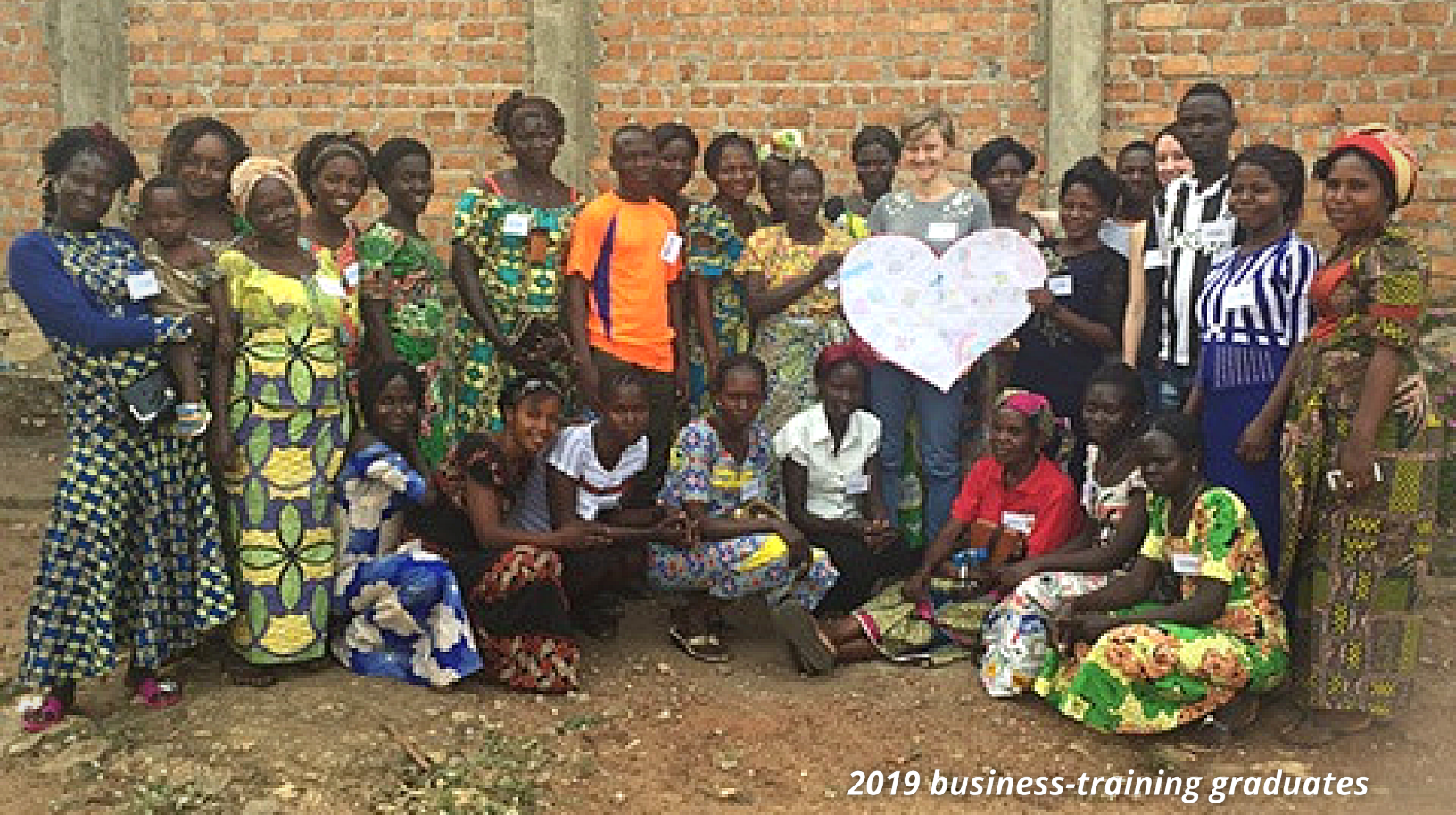
2019 business-training graduates